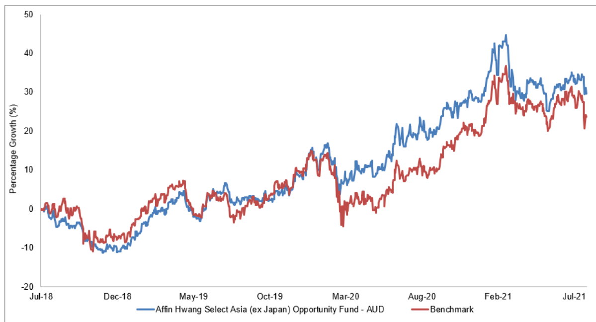
Figure 1: Movement of the Fund versus the Benchmark since commencement.