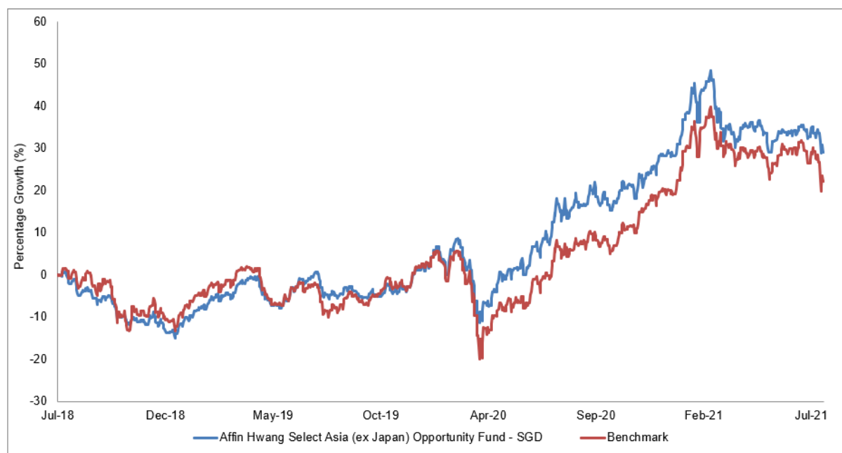
Figure 1: Movement of the Fund versus the Benchmark since commencement.