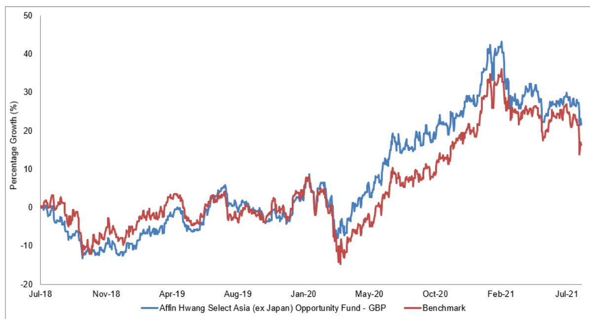
Figure 1: Movement of the Fund versus the Benchmark since commencement.