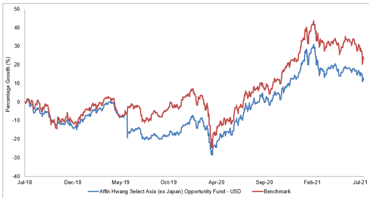
Figure 1: Movement of the Fund versus the Benchmark since commencement.

"This information is prepared by Affin Hwang Asset Management Berhad (AFFINHWANGAM) for information purposes only. Past earnings or the fund's distribution record is not a guarantee or reflection of the fund's future earnings/future distributions. Investors are advised that unit prices, distributions payable and investment returns may go down as well as up. Source of Benchmark is from Bloomberg."