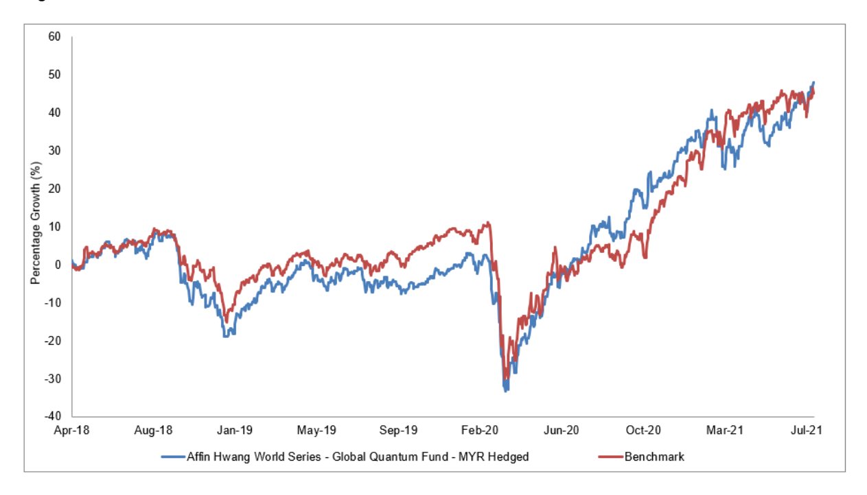
Figure 1: Movement of the Fund versus the Benchmark

"This information is prepared by Affin Hwang Asset Management Berhad (AFFINHWANGAM) for information purposes only. Past earnings or the fund's distribution record is not a guarantee or reflection of the fund's future earnings/future distributions. Investors are advised that unit prices, distributions payable and investment returns may go down as well as up. Source of Benchmark is from Bloomberg."