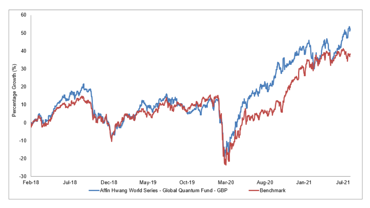
Figure 1: Movement of the Fund versus the Benchmark

"This information is prepared by Affin Hwang Asset Management Berhad (AFFINHWANGAM) for information purposes only. Past earnings or the fund's distribution record is not a guarantee or reflection of the fund's future earnings/future distributions. Investors are advised that unit prices, distributions payable and investment returns may go down as well as up. Source of Benchmark is from Bloomberg."