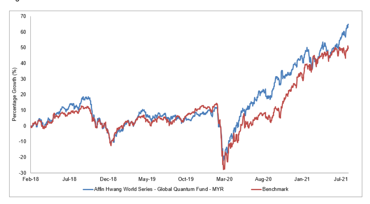
Figure 1: Movement of the Fund versus the Benchmark

"This information is prepared by Affin Hwang Asset Management Berhad (AFFINHWANGAM) for information purposes only. Past earnings or the fund's distribution record is not a guarantee or reflection of the fund's future earnings/future distributions. Investors are advised that unit prices, distributions payable and investment returns may go down as well as up. Source of Benchmark is from Bloomberg."