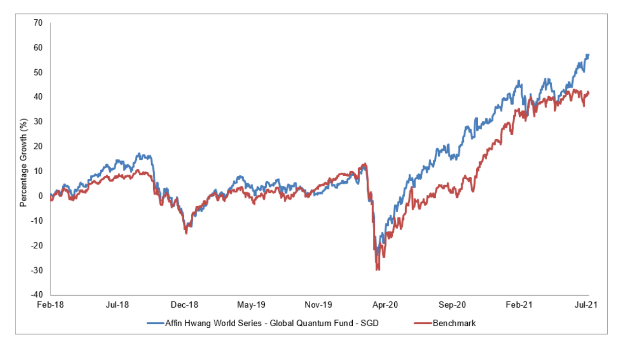
Figure 1: Movement of the Fund versus the Benchmark

"This information is prepared by Affin Hwang Asset Management Berhad (AFFINHWANGAM) for information purposes only. Past earnings or the fund's distribution record is not a guarantee or reflection of the fund's future earnings/future distributions. Investors are advised that unit prices, distributions payable and investment returns may go down as well as up. Source of Benchmark is from Bloomberg."