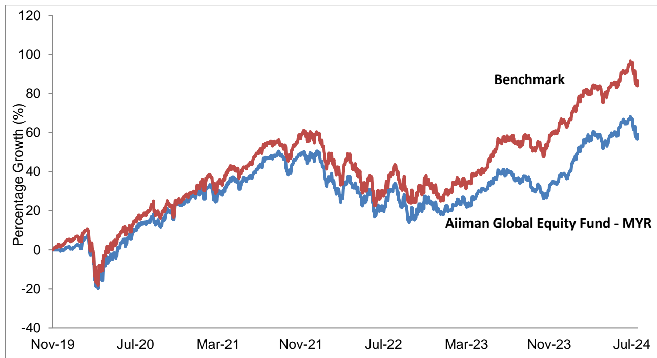
Figure 1: Movement of the Fund versus the Benchmark since commencement.

“This information is prepared by AIIAMAN Asset Management Sdn Bhd for information purposes only. Past earnings or the fund’s distribution record is not a guarantee or reflection of the fund’s future earnings/future distributions. Investors are advised that unit prices, distributions payable and investment returns may go down as well as up. Source of Benchmark is from Bloomberg.” Benchmark: Dow Jones Islamic Market World Index