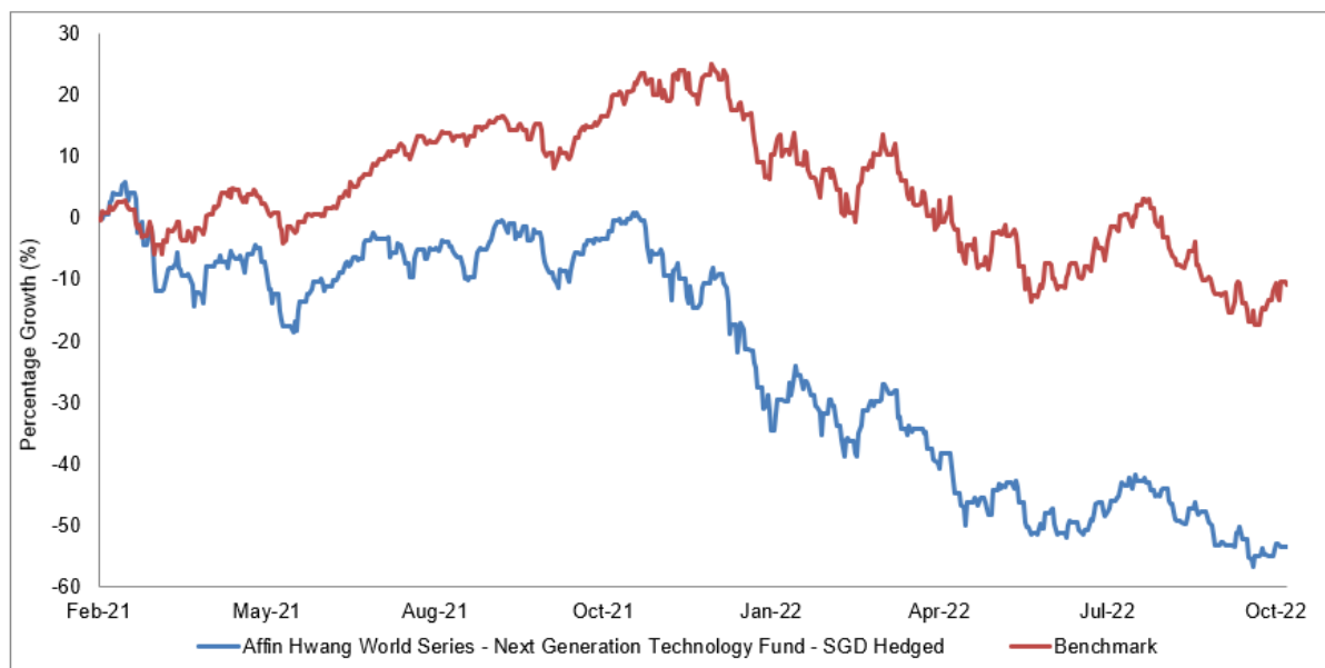
Figure 1: Movement of the Fund versus the Benchmark since commencement.

"This information is prepared by AHAM Asset Management Berhad (formerly known as Affin Hwang Asset Management Berhad) (AHAM) for information purposes only. Past earnings or the fund's distribution record is not a guarantee or reflection of the fund's future earnings/future distributions. Investors are advised that unit prices, distributions payable and investment returns may go down as well as up. Source of Benchmark is from Bloomberg."