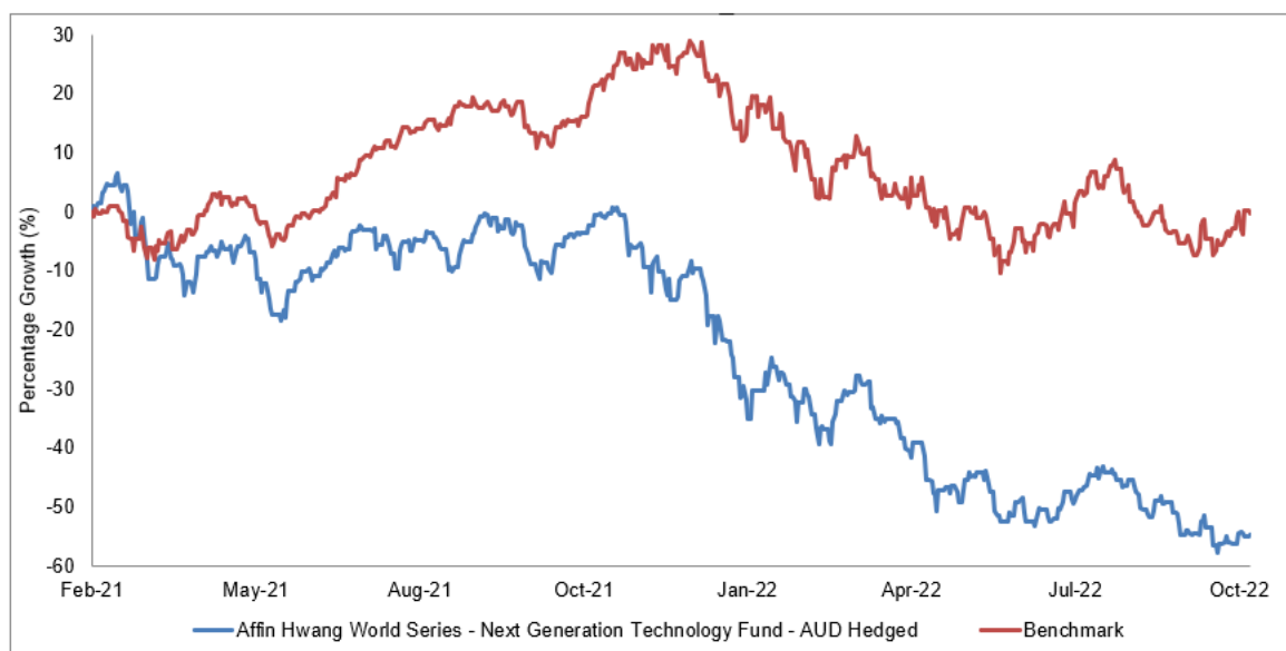
Figure 1: Movement of the Fund versus the Benchmark since commencement.